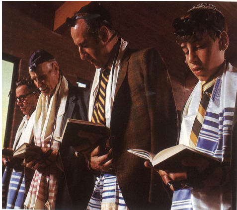
Flame Tree Publishing

A. Pick one thing from this photograph which shows that these people are practising their religion.